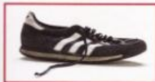
A shoe worn by Terry Fox during his run across Canada

Children gave change, people cheered, and Canada pitched in as Terry Fox ran through Ontario. Terry began to think big – one dollar from every Canadian for cancer research. "If you've given a dollar," he said in one of his many speeches, "you are part of the Marathon of Hope."