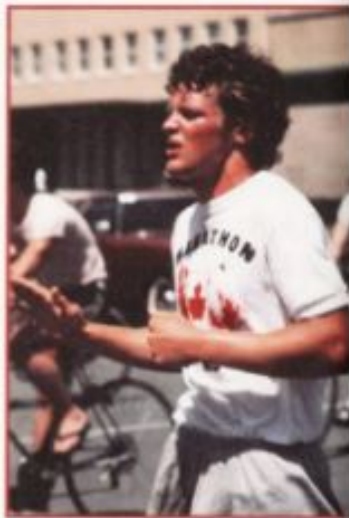
Terry Fox waves to the crowd as he runs through Toronto on his Marathon of Hope.

The country responded. In Montreal, Quebec, businessman Isadore Sharp organized a fundraiser.