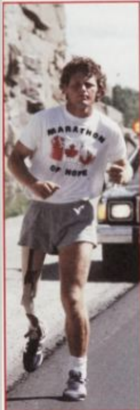
Terry Fox runs along the Trans-Canada Highway in northern Ontario, escorted by police.

while his loved ones and all of Canada mourned.