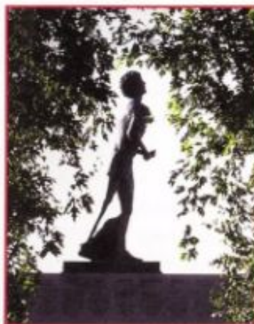
This monument near Thunder Bay marks the end of Terry Fox's cross-country run.

For months Terry Fox fought the hardest battle of his life, and he was even able to return home for a while. He never gave up his dream of finishing the Marathon of Hope. But on June 28, 1981, with his family around him, Terry Fox died. Flags on all Canadian federal buildings were lowered to half staff. He was laid to rest at Port Coquitlam cemetery,